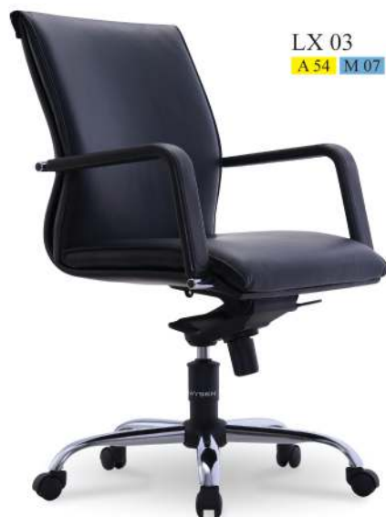
LX 03 A 54 M 07 B 05

Chrome-plated cantilevered steel base gives the illusion of defying gravity stylishly.