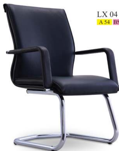
LX 04 A 54 BS 16