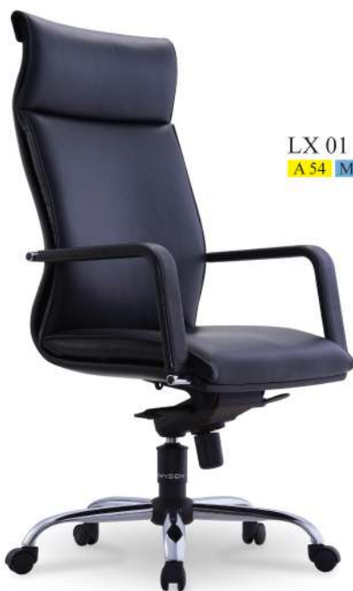
LX 01 A 54 M 07 B 05