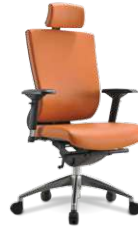
PRO-01 1200-1300(H) x 690(W) x 690(D)