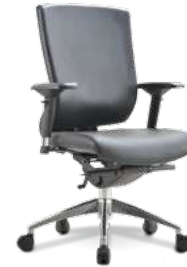
PRO - 03 1060-1160(H) x 690(W) x 690(D)