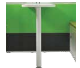
Built-in aluminium stand provides a surface to work in privacy, and is open to your imagination.