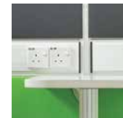
PRICUSS is occupied with electrical power outlets for better productivity, and useful for presentations.