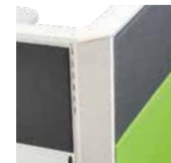
Aesthetically pleasing triangular design further enhances the outlook and embodies modernity.