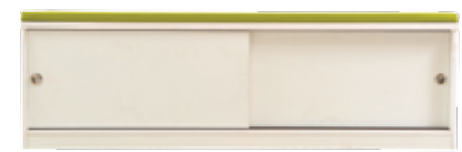
PRI - 1 1200(W) x 400(D) x 500(H)