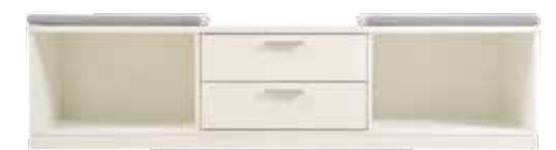
PRI - 3 1500(W) x 400(D) x 500(H) PRI - 4 1800(W) x 400(D) x 500(H)