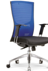
AI - 03 980-1080(H) x 570(W) x 580(D)