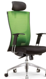
AI - 01 1120-1220(H) x 570(W) x 580(D)