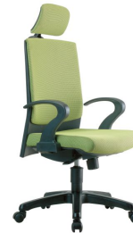
TH - 05 1080 - 1180(H) X 580(W) X 590(D)