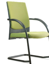
TH - 04 960 (H) X 580(W) X 660(D)