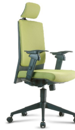
TH - 01 1150 - 1250(H) X 570(W) X 590(D)