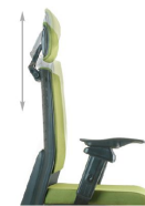
Height adjustable backrest for better lumbar support.